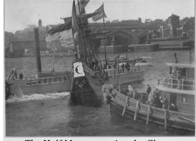
The Half Moon ramming the Clermont

On April 11, 1908 the Netherlands Hudson-Fulton Celebration Commission was formed under the patronage of His Royal Highness, Prince of the Netherlands, Duke of Mecklenburg and tasked with building a replica of the Half Moon.